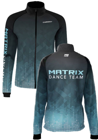
Custom Warm Up Jacket

Samples will come out between 9/1-9/15 to try on and order to purchase.