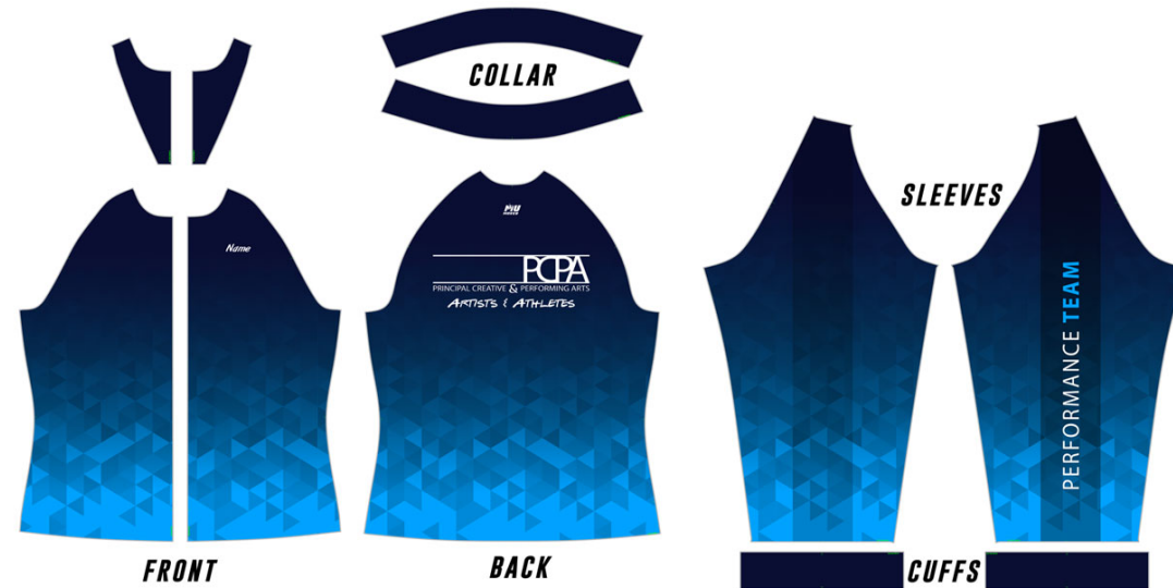
PCPA Design Preview