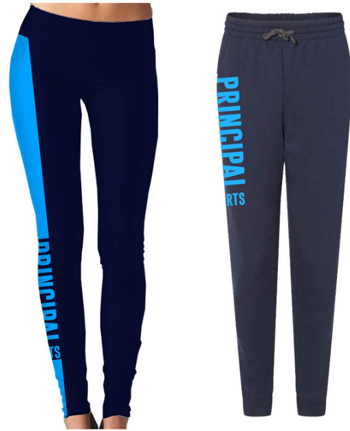
PCPA Leggings & Joggers