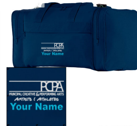
PCPA Duffel Bag